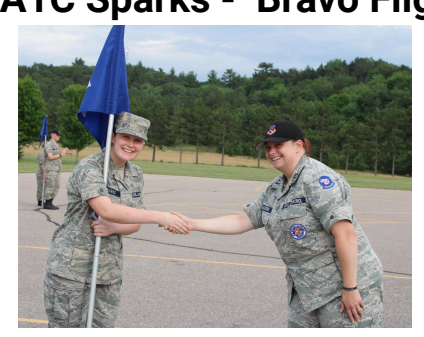
SPIRIT AWARD OF THE DAY: SUPPORT STAFF